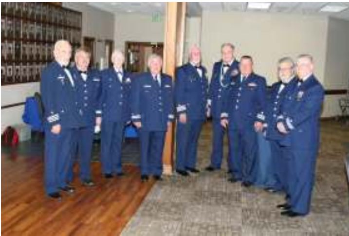
Division Staff after Swearing In