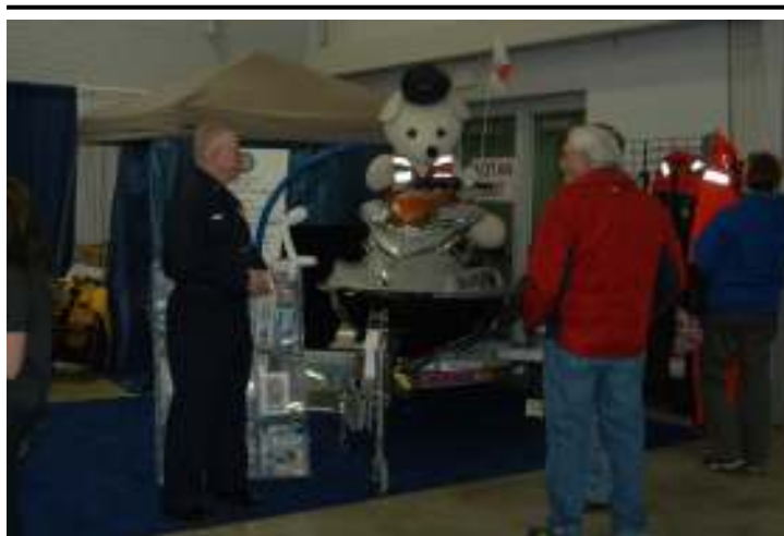
2014 Boat Show Booth