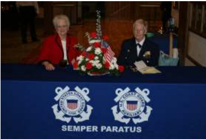
Registration Table