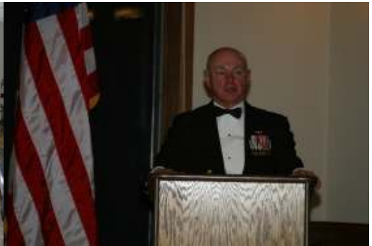
VADM Terry Cross